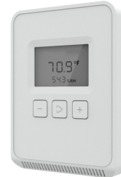
LCD with Buttons